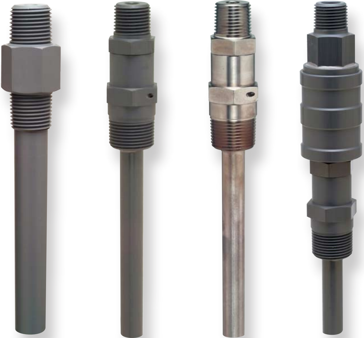
Non-Retractable Injection Quills